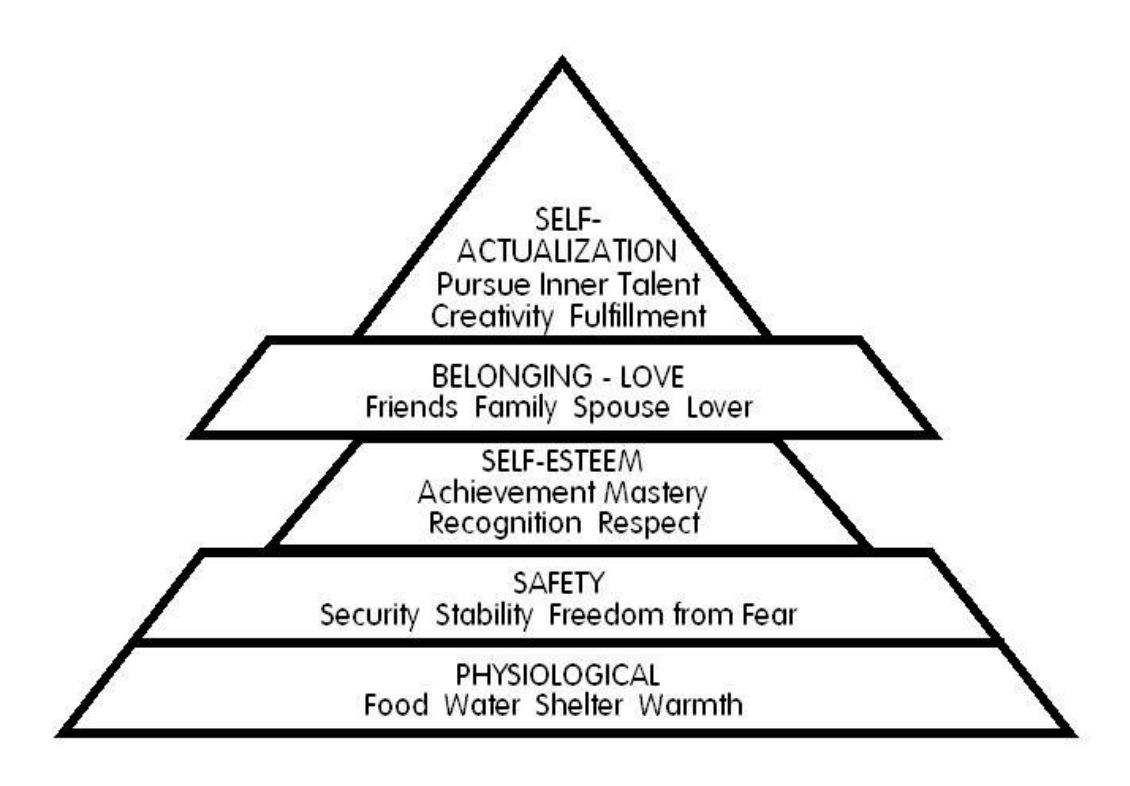
Figure 2: The inversion of Maslow's hierarchy of human needs in 20th century education.

I have often heard the claim in the field of education that an effective way to bolster student self-esteem is to provide students with opportunities to experience a great deal of success. Consequently, efforts are made to ensure that the school work is easy enough so students have little difficulty completing the work correctly, thereby fostering trust in their own abilities. As expected, students do begin to develop self-worth. But in the process, they also learn that their worth as individuals is contingent upon being able to jump through the prescribed academic, physical, or personal hoops.