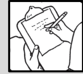
pen and paper