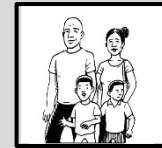
get my family