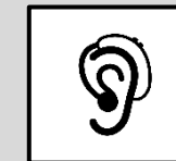
assistive listening devices